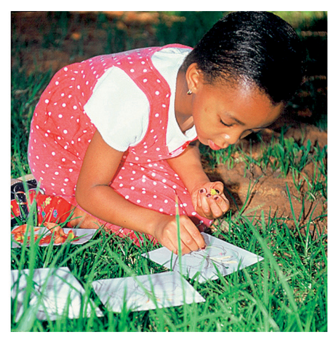
"The eye that sees and the hand that obeys," South Africa

Through what are known as the Five Great Lessons, she opened doors on to the drama of the uni-