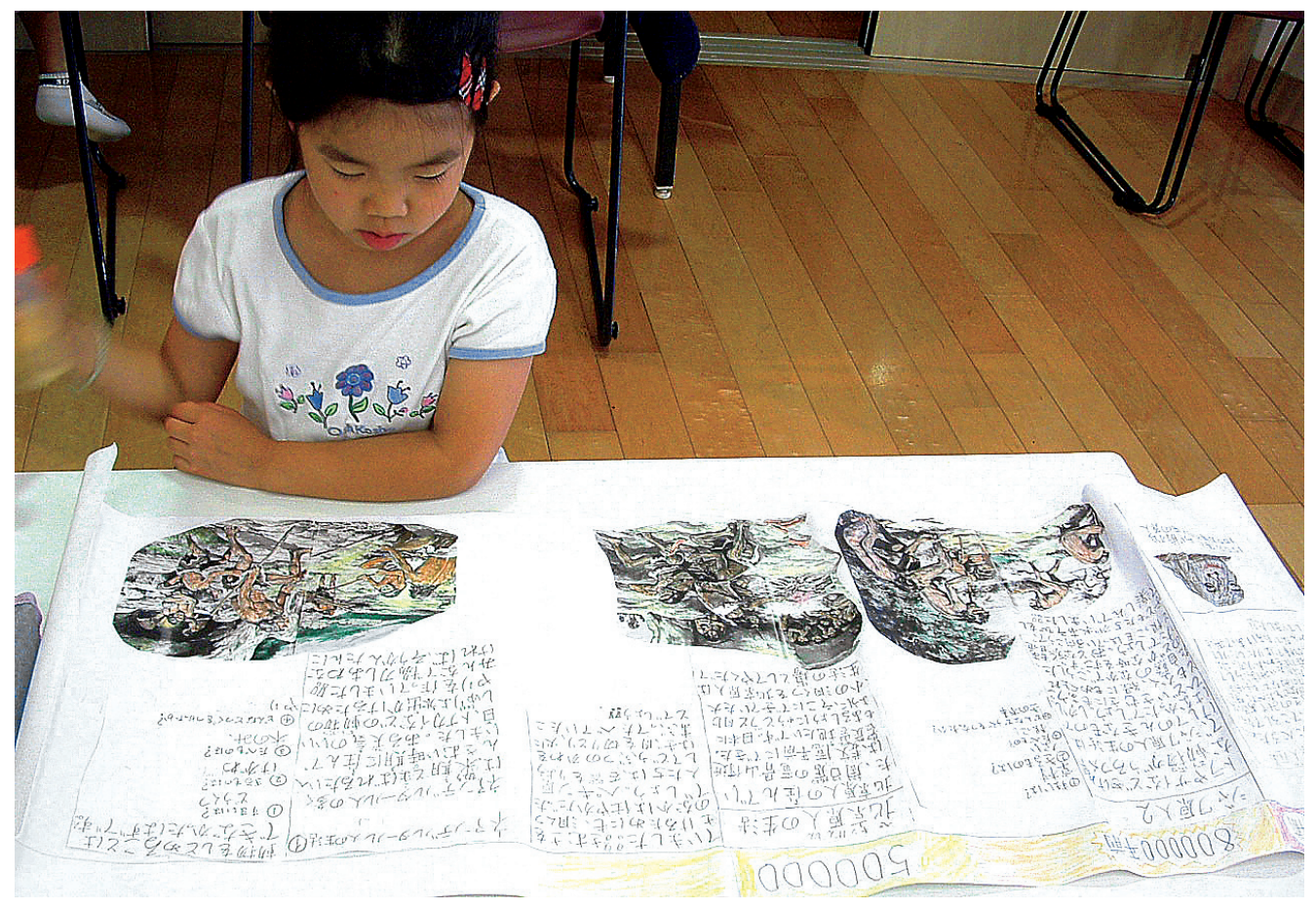
Researching the Timeline of Humans, Japan

History, as the story of man and his achievements, is at the center of Cosmic Education because of the nature of the being whose story it is. The understanding of our place in the universe depends on the understanding of the law and order which governed the elements of the created universe and our world as part of it, the plants and animals that play their part in conserving that order and then, above all, the recognition of the gifts with which man is endowed, intellect and love, and of the understanding and realization of the reason why those gifts were given–had to be given–if the universe were to be complete.